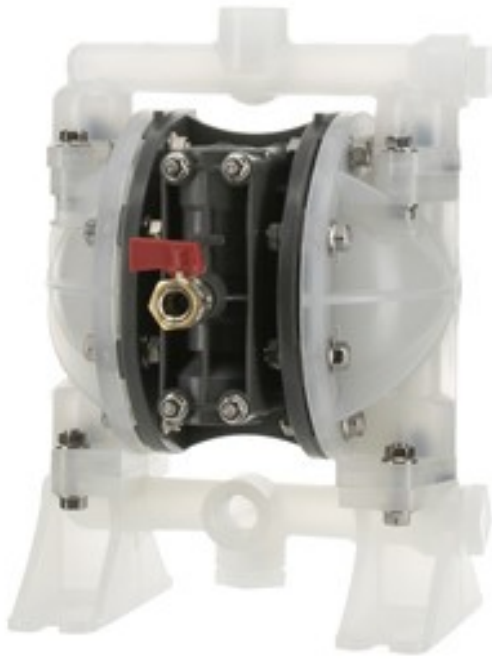
■ G15P□, G15V□